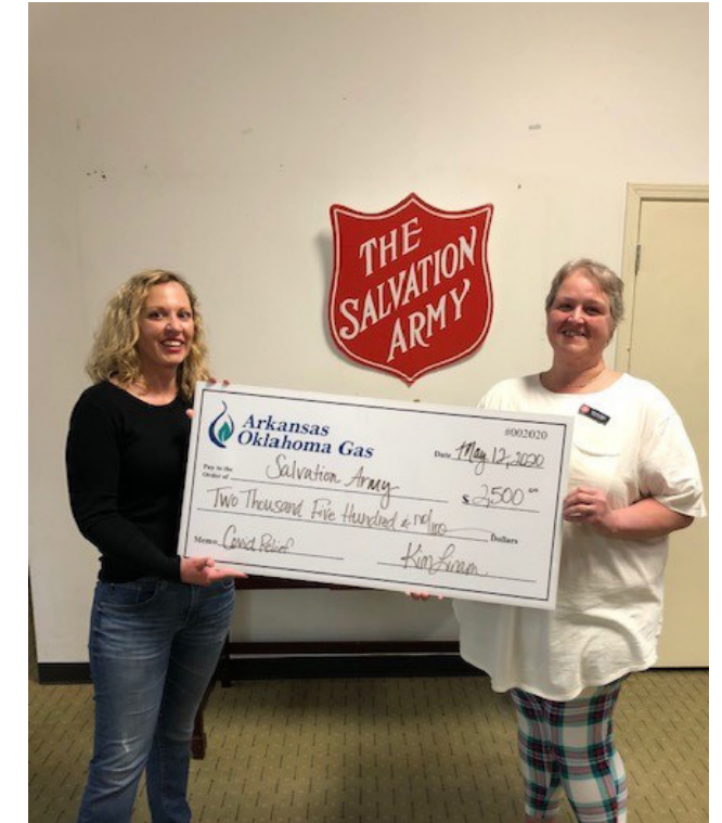
The Salvation Army was swiftly able to assist 20 families with past due utility bills which piled up due to temporary job loss.